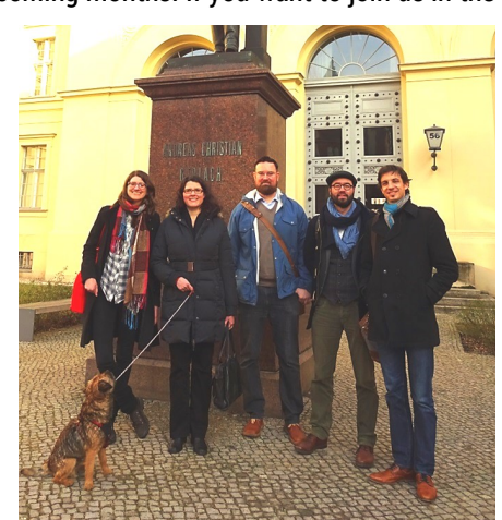
Network Meeting at the HU, Berlin